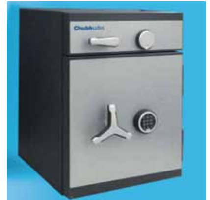
Chubbsafes ProGuard DT