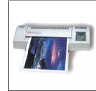
GBC Proseries A3 Laminator