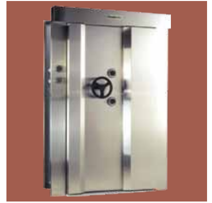
Chubbsafes UL Listed Vault Doors