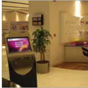
Client Service Area Management Systems