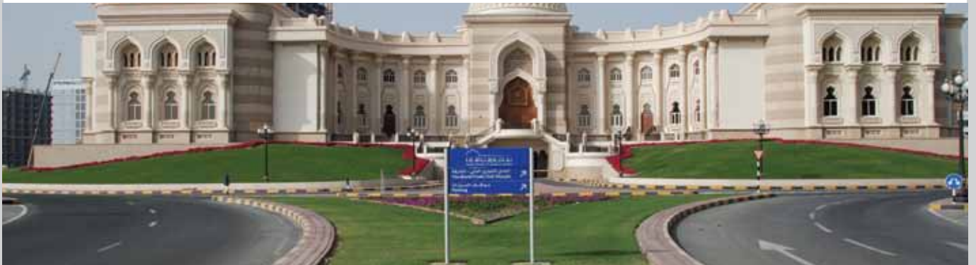
Sharjah Chamber of Commerce and Industry, Sharjah