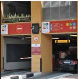
Business Village, Dubai