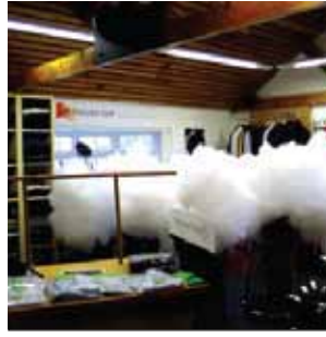
Advanced Fog System