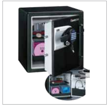
SentrySafe Data Media