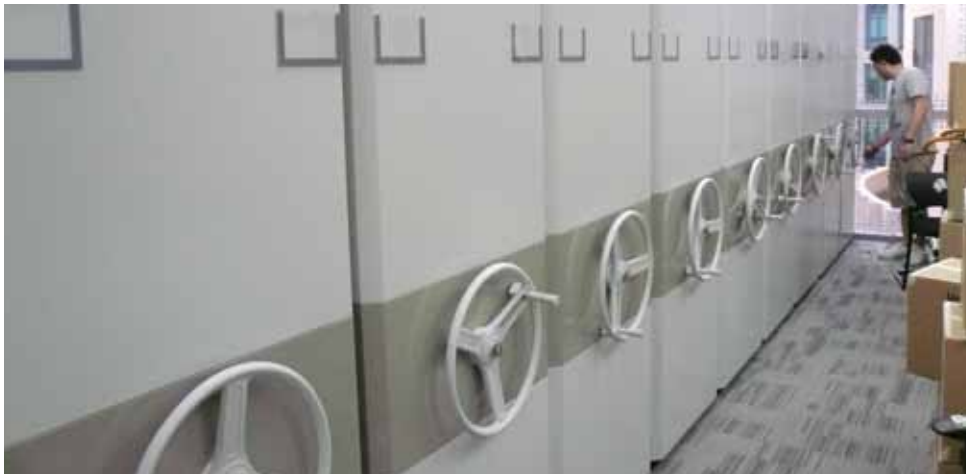
Rotary Mobile Shelving System