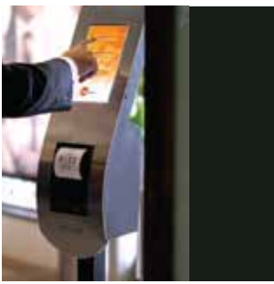
Touch Screen Ticket Dispenser