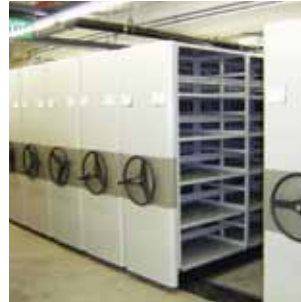
Rotary Mobile Shelving System