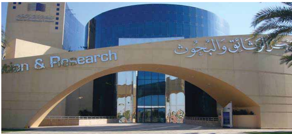
Zeus - A Perfect fit for NCDR Abu Dhabi