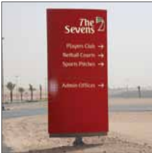
The Sevens. Dubai