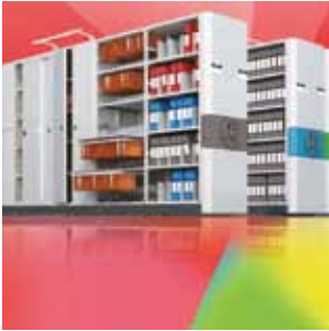
Rotary Mobile Shelving System