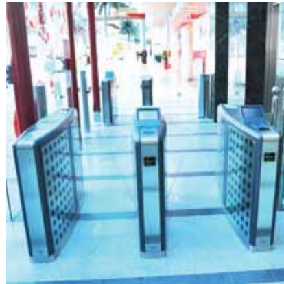
Gunnebo Speed Gates