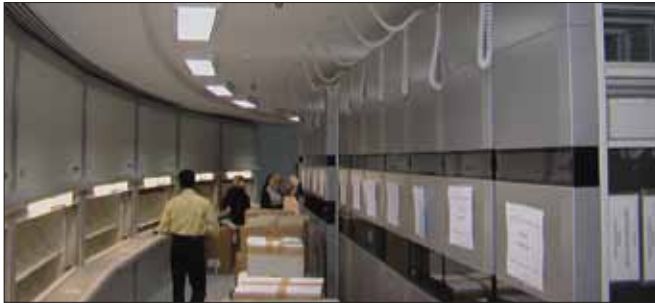
National Centre for Documentation and Research, Abu Dhabi