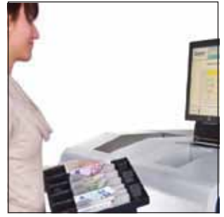
Gunnebo Cash Handling

For further information on our Wayfinding services, please visit www.axon.ae