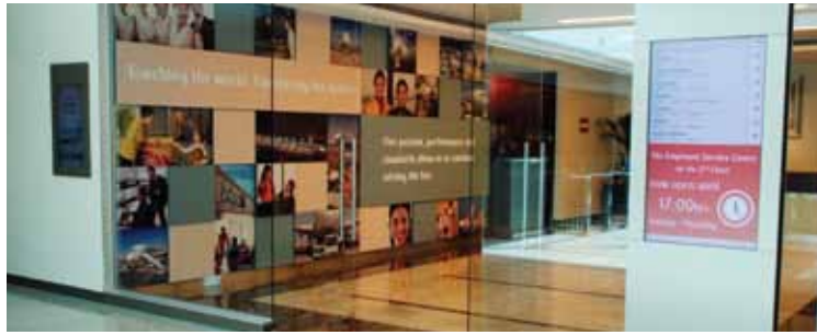
Emirates HQ, Dubai