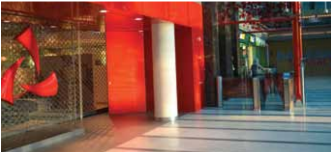
Bank Muscat, Oman