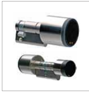
ISGUS Lock Cylinder