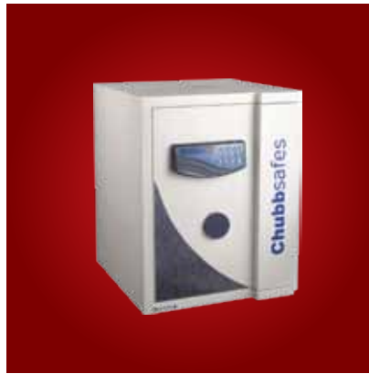
Chubbsafes Electronic Home Safe