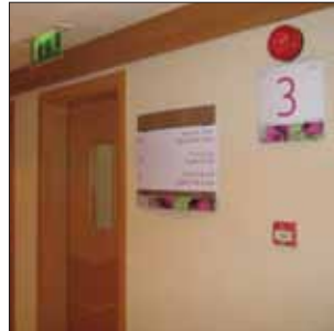
Cromwell Hospital, Al- Ain