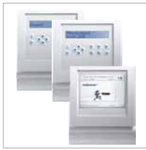
ISGUS Time Management