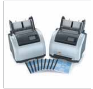
GBC Proclick Pronto Binder