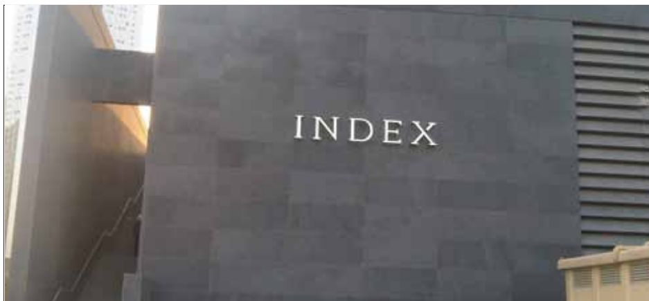
Index Tower , Dubai