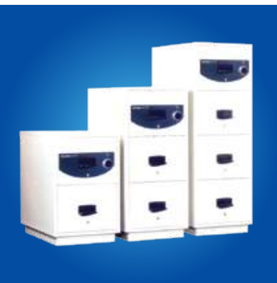
Chubbsafes Fire Resistant Filing Cabinets