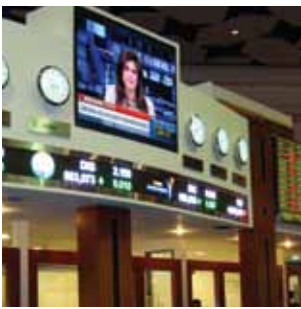
Digital Signage Display