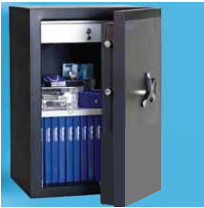
Chubbsafes ProGuard Grade III