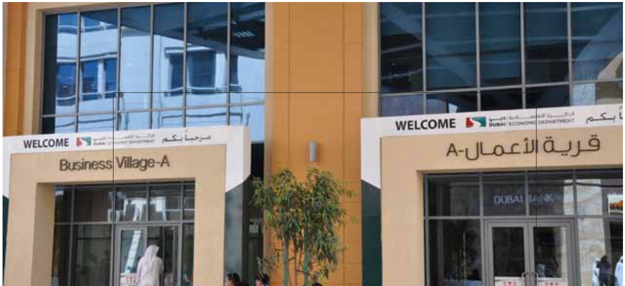
Business Village, Dubai