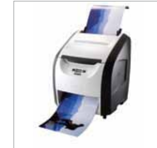
GBC AutoUltima - Pro