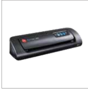
GBC Pouch Laminator