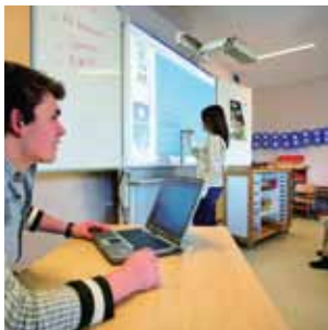
Legamaster Interactive Board