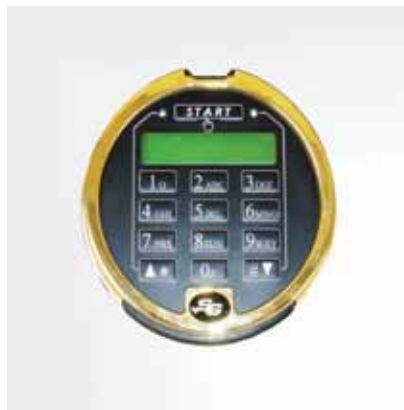
Sargent & Greenleaf Biometric Lock