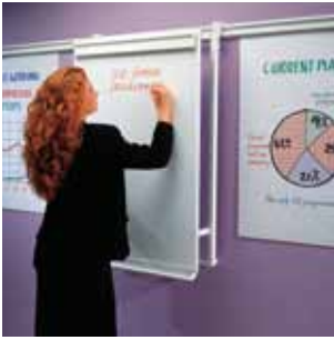
Legamaster Professional Rail System