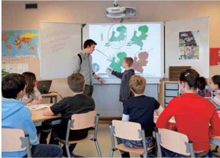
Legamaster Interactive Board