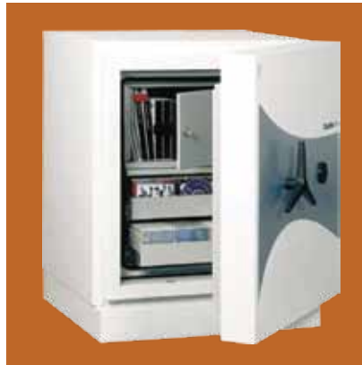
Chubbsafes Data Plus