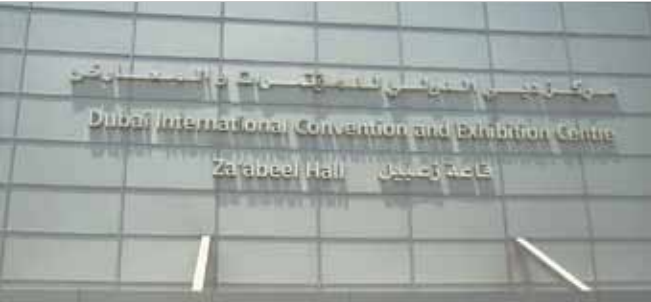
DWTC , Dubai