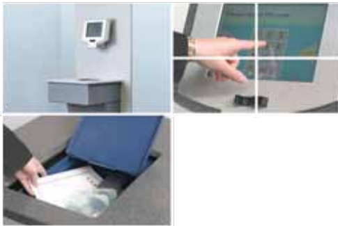
Self Service Safe Deposit Box