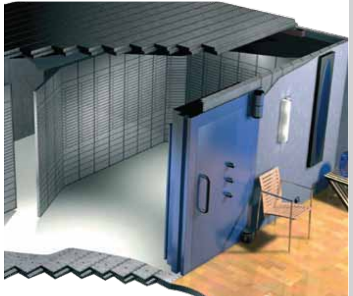
Centurion Modular Vault Room